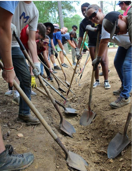
Ordeal candidates and Brothers clear a drainage ditch by the main shower house

Each SSF starts with an Ordeal on Thursday and runs through dinner on Friday. The lodge inducted 47 new Ordeal Honor members during the Ordeal, and there were 46 Arrowmen in attendance, providing cheerful service beside their future Brothers.