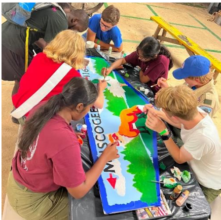
Arrowmen at SSF help paint a commemorative lodge flap

Saturday night saw Muscogee award 14 Brotherhood Honor sashes to those who passed the Brotherhood Challenge earlier in the day. The lodge celebrated all honors at the evening cracker barrel of personal pizzas and a marathon patch auction.