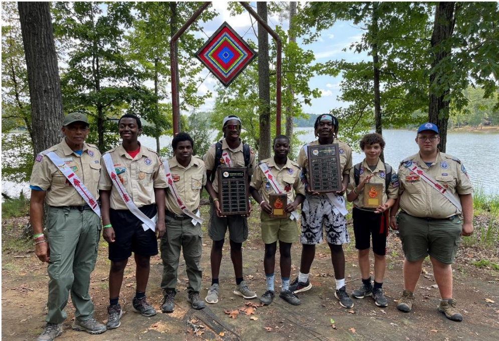
Arrowmen from Sukeu Sipo win Chapter of the Fellowship!!!