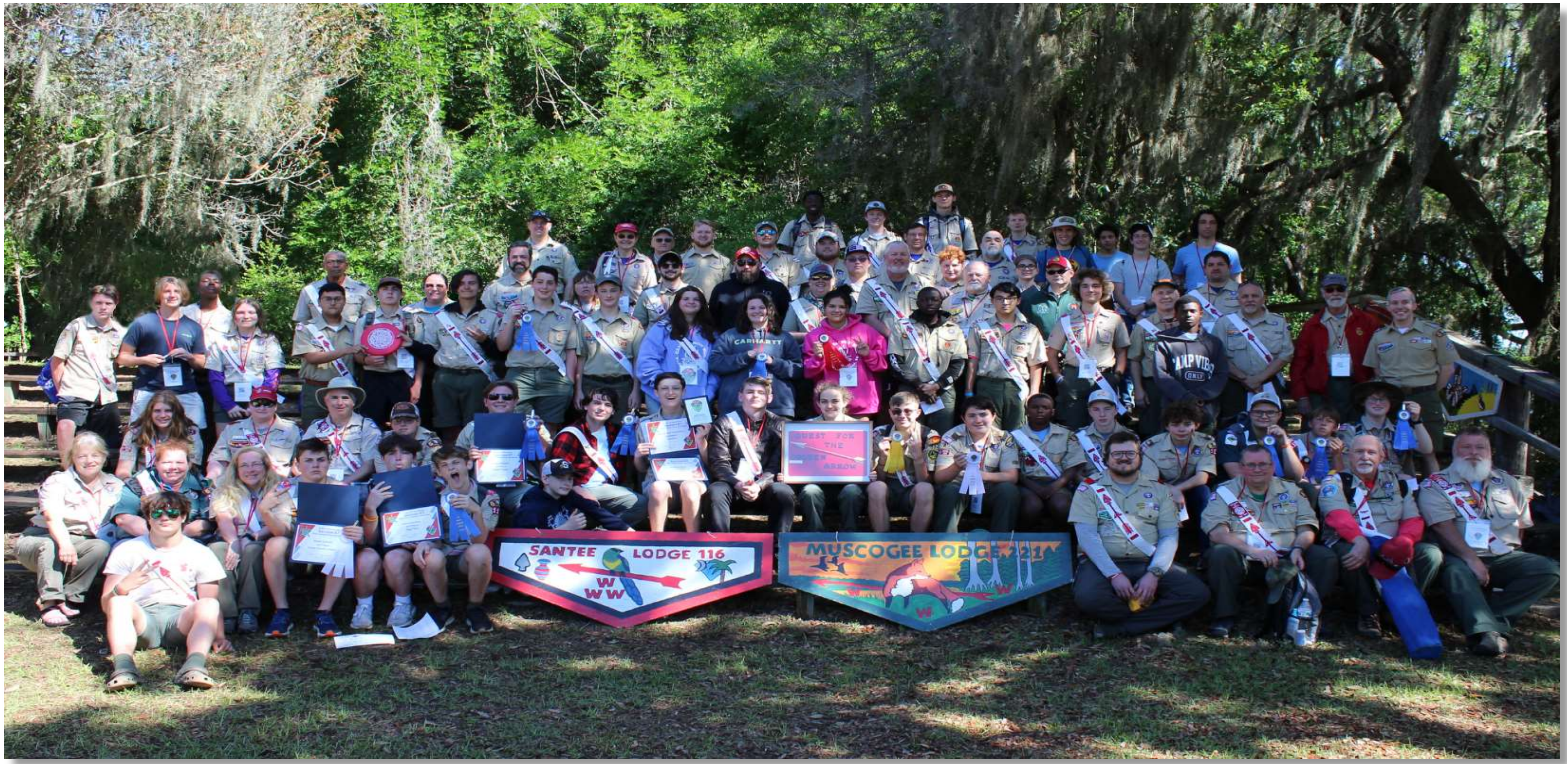
Muscogee #116's Cornerstone Conclave contingent, basking in the glory of another successful showing