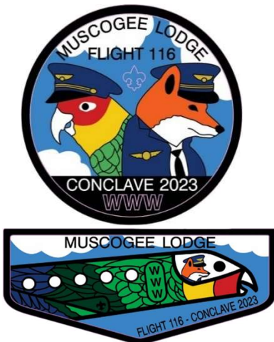
"Muscogee Flight #116" Delegate Set

Although it was our first Conclave, we were able to snag The Golden Arrow, and I am genuinely proud of you all. I hope everyone was able to enjoy Conclave and trade up all their patches!