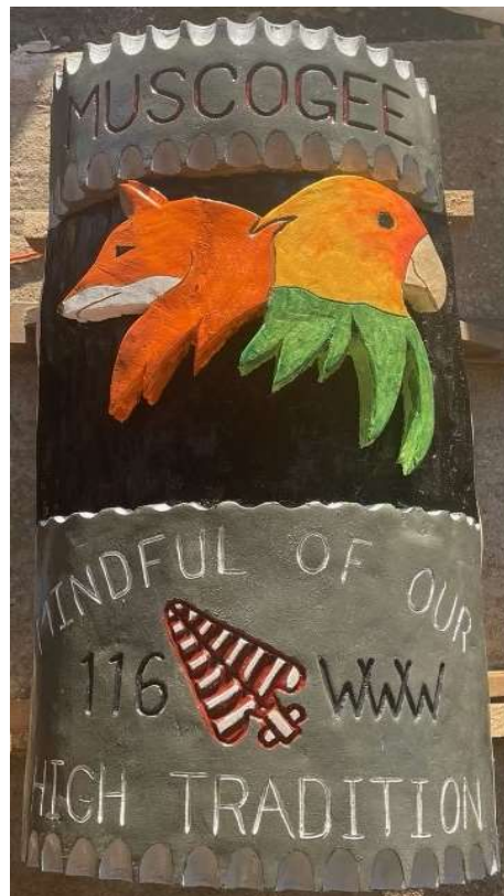
Muscogee #116 Hand-carved Totem Pole