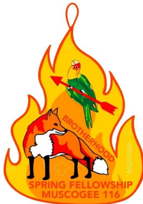
2023 Spring Fellowship Patch

The Muscogee Lodge #116 Spring Fellowship is May 19-21, 2023, at Camp Barstow. Be Prepared: get Registered! There are plenty of fun events planned, so come out and show your spirit as we remember to KEEP THE FIRE BURNING!