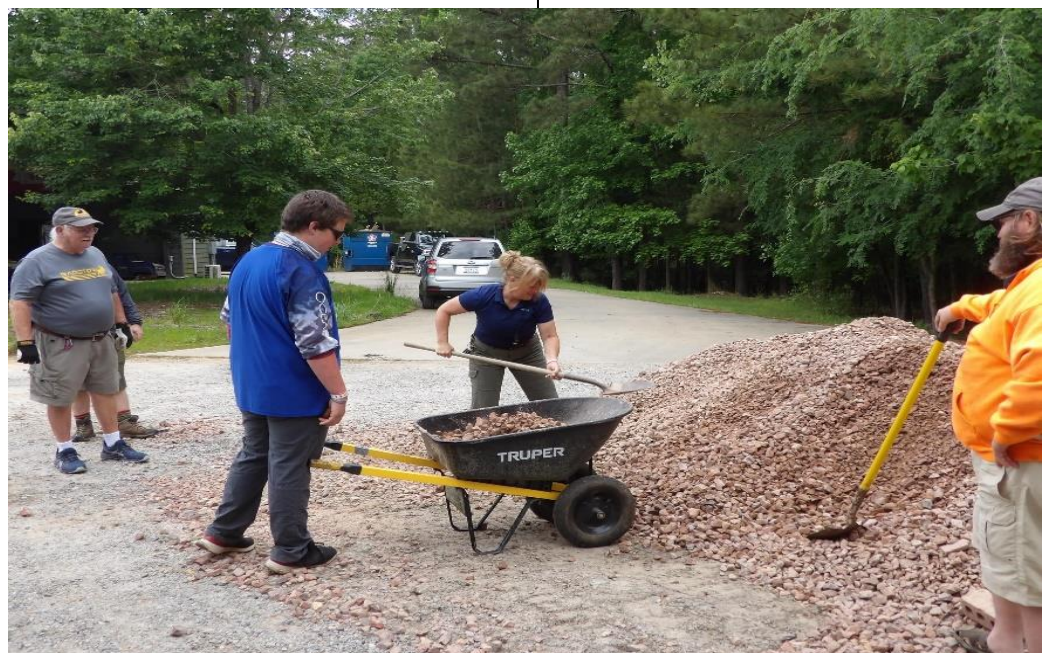
Ordeal candidates hard at work at Spring Inductions 2023!

During the weekend, a special Conclave Fellowship Prep. event was held to prepare the contingent of lodge members attending this year's Conclave at Camp Ho Non Wah from April 21-23. The Conclave includes the Quest For The Golden Arrow, a collection of challenging events in which each lodge across our Section competes head-to-head. Other competitions include ceremonies teams, Native American dance, and drum/sing. There are always last-minute participant substitutions at Conclave, so don't worry if you missed the prep weekend – there are loads of ways to participate in Conclave!