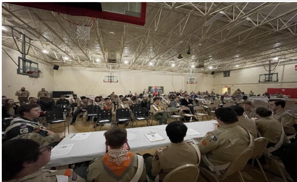
Successful Business Meeting at Winter Banquet

At the Winter Banquet in January, we held our first business meeting, officially making us a lodge! During the meeting we formalized lodge rules discussed in the preceding months. Many changes were made with both previous lodges in mind. Some changes included the merging of the totems, awards, and an overall revision of